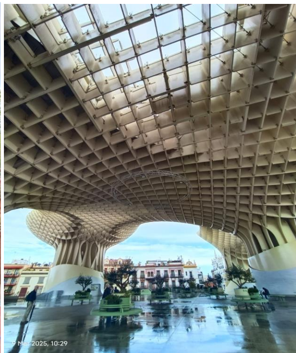
Historic and contemporary landmarks in Seville, Spain, including Plaza de España and the Metropol Parasol.