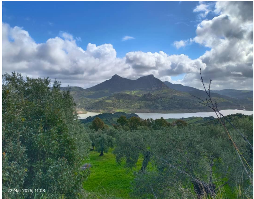
Natural landscapes of Andalusia, Spain, including El Tajo Gorge in Ronda and the Zahara–El Gastor Reservoir.