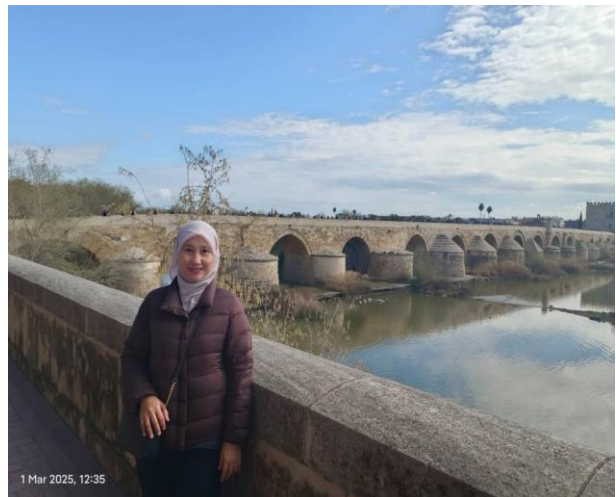
Roman heritage sites in Andalusia, Spain, including Italica and the Roman Bridge of Cordoba.