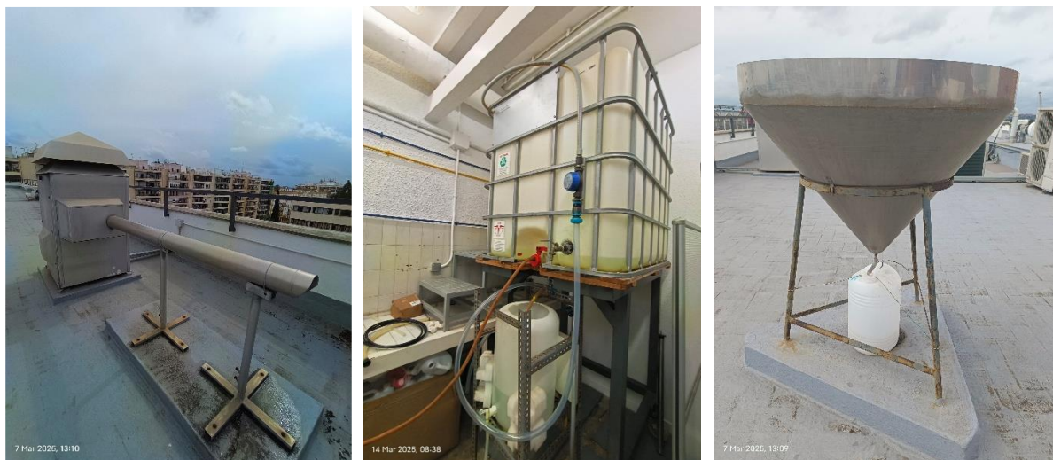
Environmental radioactivity monitoring facilities, including high-flow air samplers with 4 ft × 4 ft filters, large-volume water tanks for routine surveillance of gamma-emitting radionuclides in drinking water, and rainwater samplers.