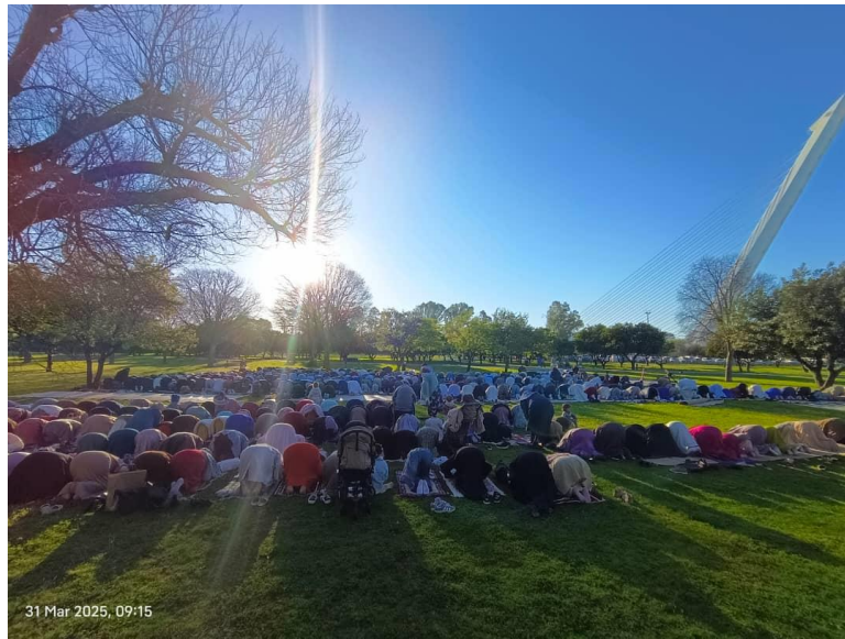
Members of the Muslim community gathering for Eid al-Fitr prayer at Alamillo Park, Seville, Spain.