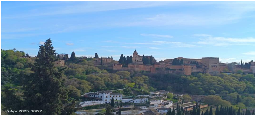
Architectural landmarks of Andalusia, Spain, featuring the Mezquita-Catedral of Cordoba, the Courtyard of the Maidens at the Real Alcazar of Seville, and the Alhambra, reflecting the region's layered Islamic and historical architectural heritage.