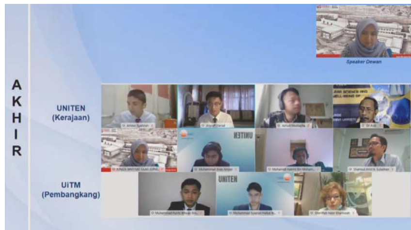
Figure 4. The final round of the InterVarsity Nuclear Debate 2020 between UNITEN and UiTM with nuclear expert judges.